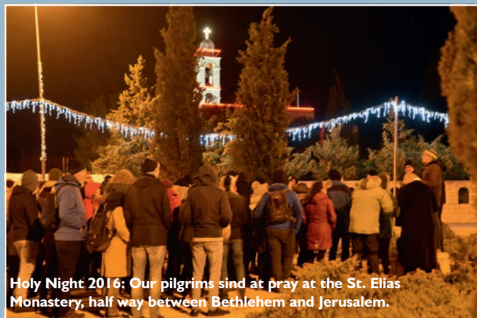
Holy Night 2016: Our pilgrims sind at pray at the St. Elias Monastery, half way between Bethlehem and Jerusalem.